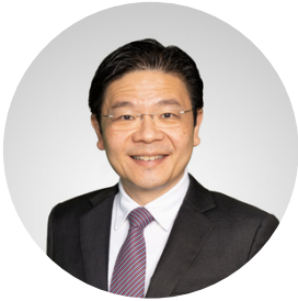
Mr. Lawrence Wong Deputy Prime Minister and Minister for Finance, Singapore

Mr Lawrence Wong is the Deputy Prime Minister and Minister for Finance. He co-chairs the Multi-Ministry Taskforce on COVID-19 and is the Deputy Chairman of the Monetary Authority of Singapore (MAS). He is also a member of the GIC Board, the Future Economy Council, the Research, Innovation and Enterprise Council and the National Research Foundation Board, and co-chairs the Singapore-Shanghai Comprehensive Cooperation Council.